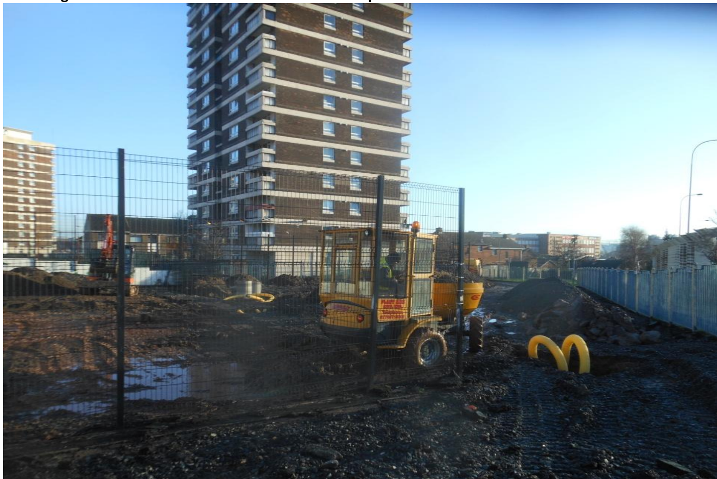
Clara Street MUGA – Under construction. Due for completion end of March